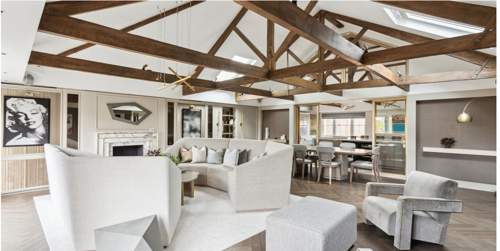
EATON SQUARE, Belgravia SW1W