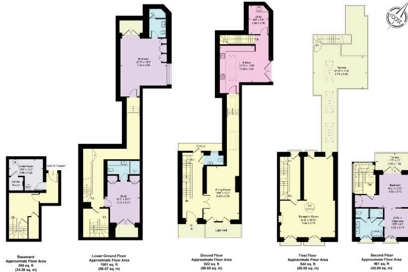
Illustration for identification purposes only, measurements are approximate, not to scale. (ID1180)