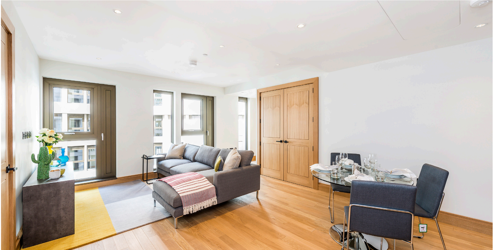
CLELAND HOUSE, Westminster SW1P