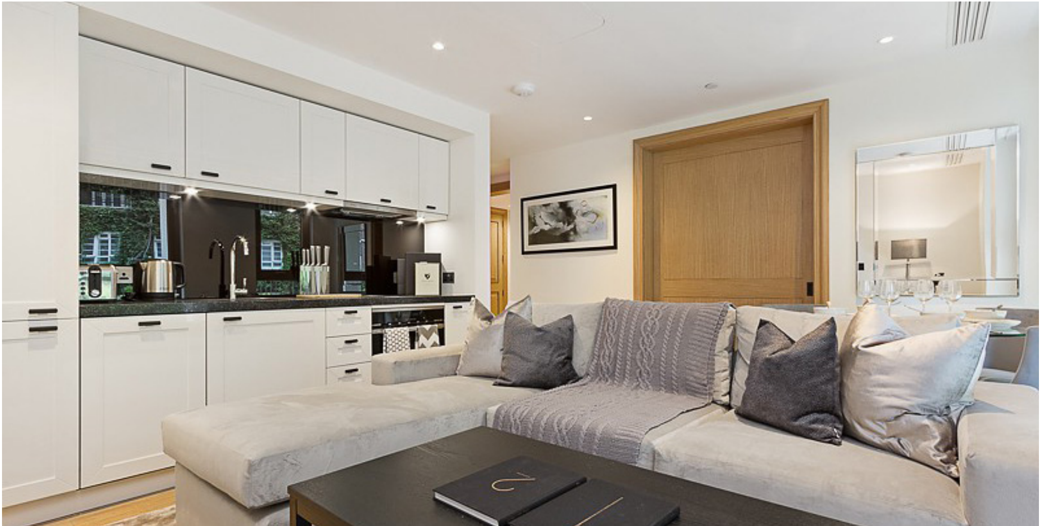
ABELL HOUSE, Westminster SW1P