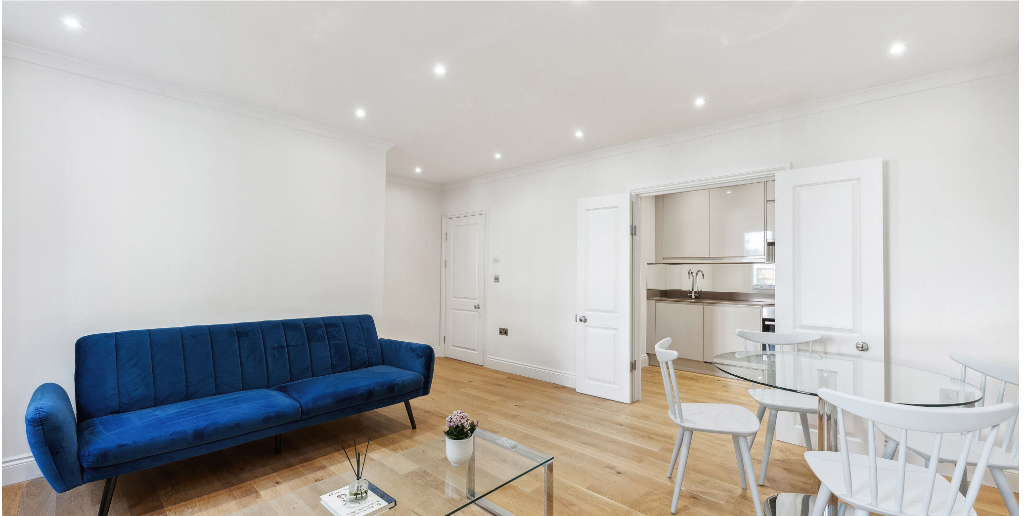
BELGRAVIA COURT, Belgravia SW1W