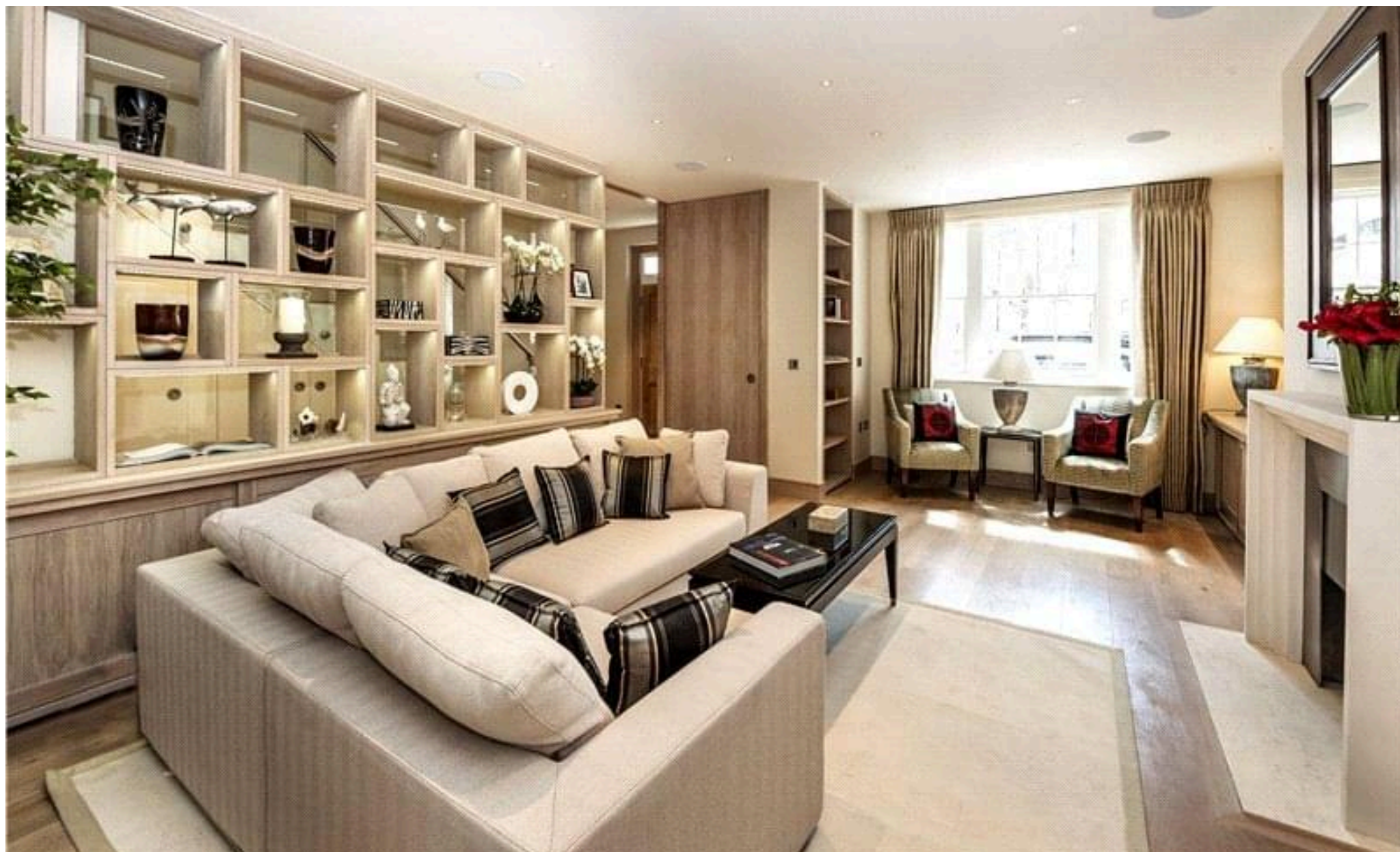
Burton Mews, Belgravia SWIW