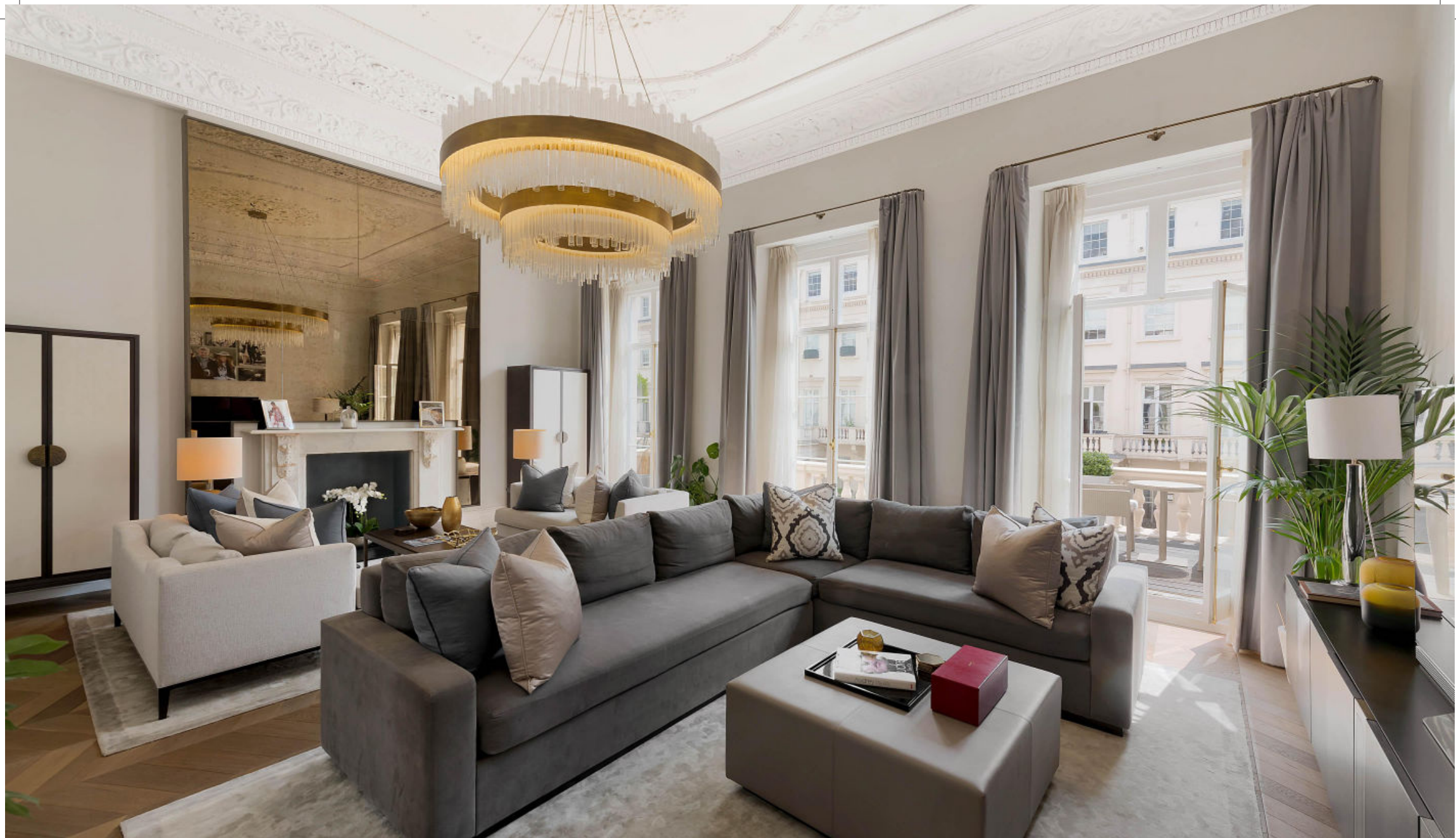
Eaton Place, Belgravia SWIX