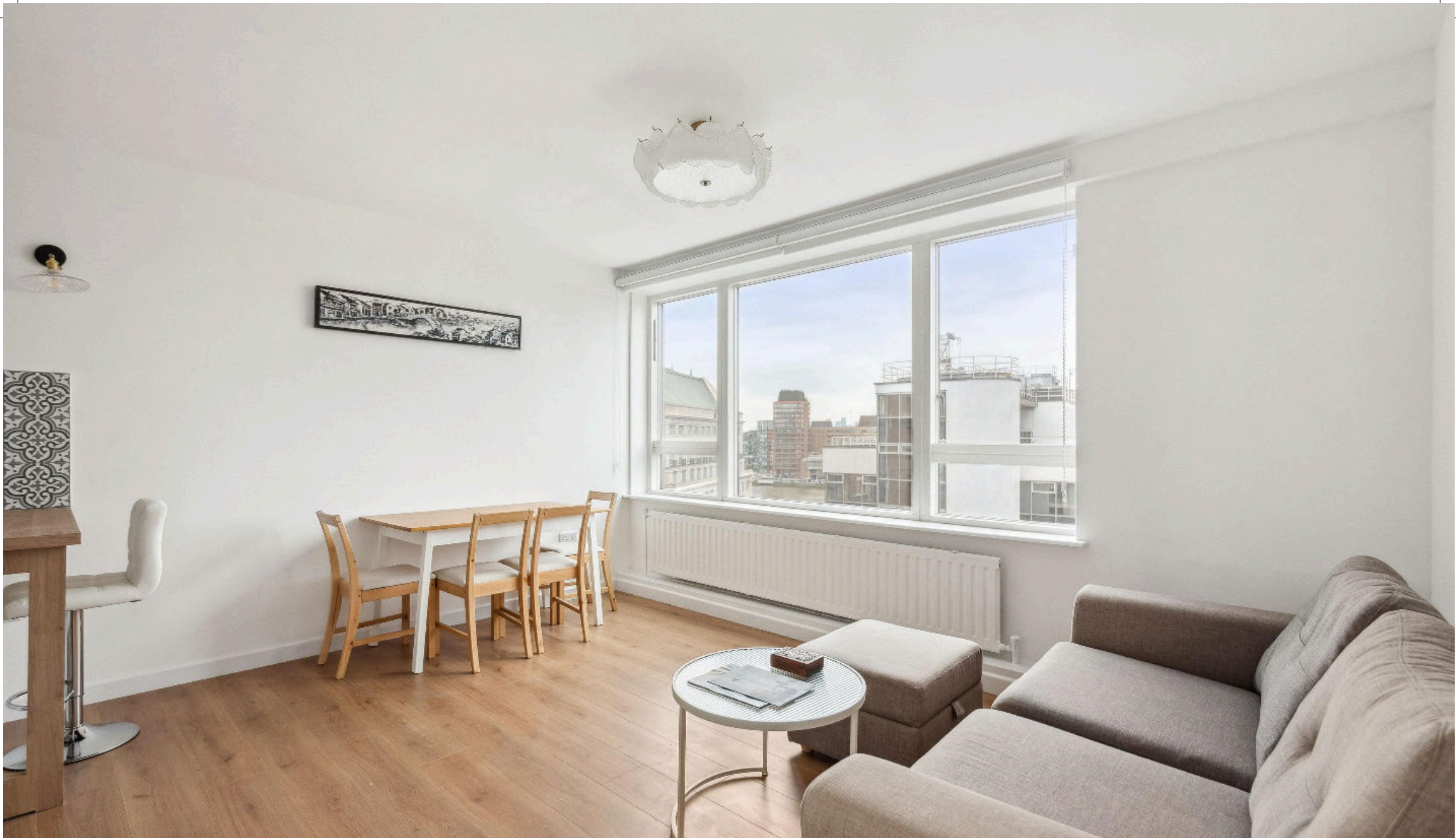
Millbank Court, John Islip Street SWIP