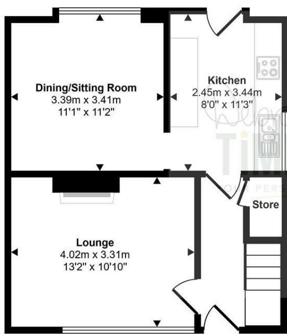
Ground Floor Approx 41 sq m / 439 sq ft

Approx Gross Internal Area 84 sq m / 905 sq ft