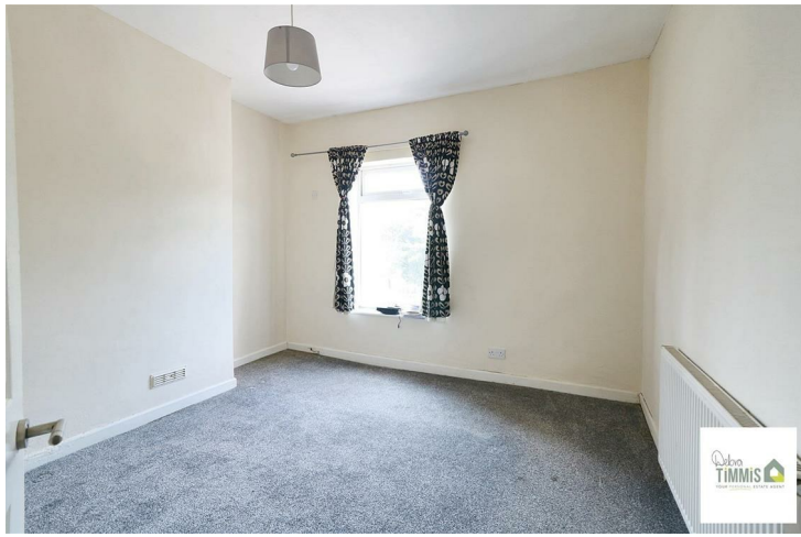
Bedroom Two 11'7" x 11'4" (3.55 x 3.46) Double glazed window. Radiator.