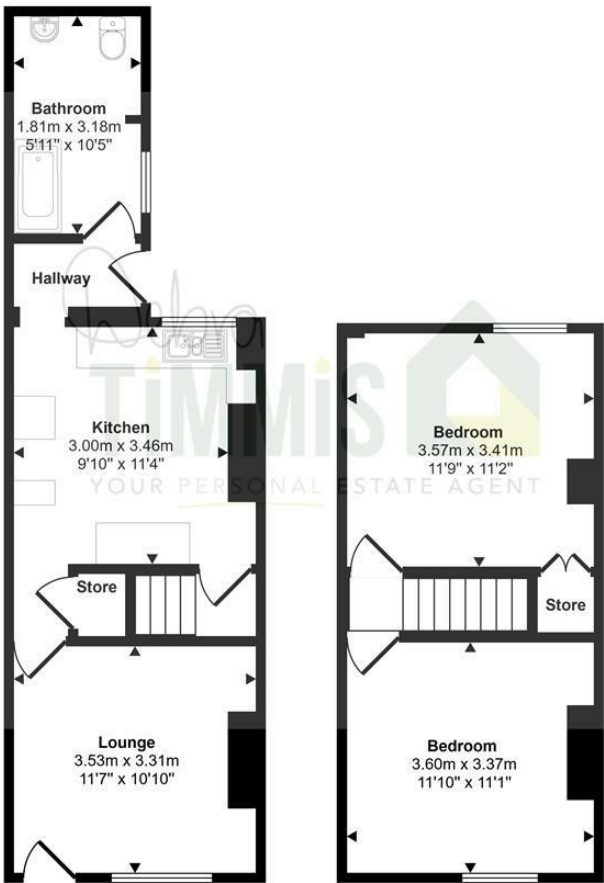
Ground Floor Approx 36 sq m / 389 sq ft

Approx Gross Internal Area 65 sq m / 696 sq ft