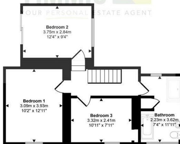
First Floor Approx 50 sq m / 542 sq ft

This floorplan is only for illustrative purposes and is not to scale. Measurements of rooms, doors, windows, and any items are approximate and no responsibility is taken for any error, omission or mis-statement. Icons of items such as bathroom suites are representations only and may not look like the real items. Made with Made Snappy 360.