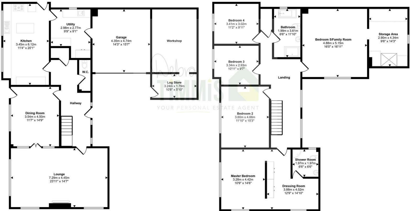
Ground Floor Approx 145 sq m / 1556 sq ft

Approx Gross Internal Area 284 sq m / 3055 sq ft