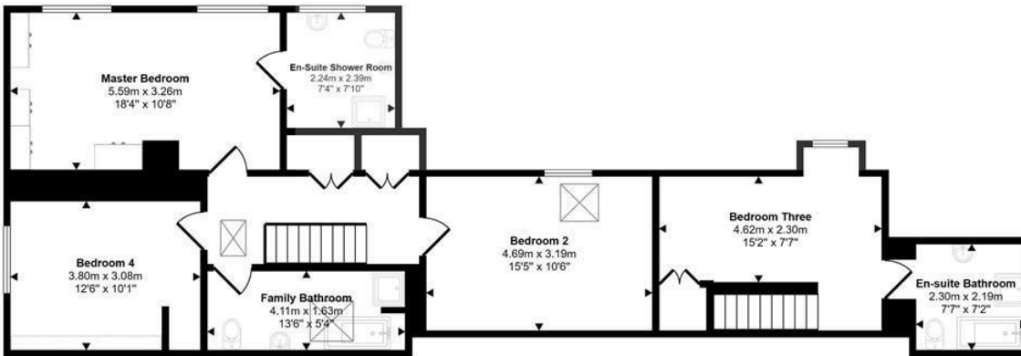
First Floor Approx 96 sq m / 1029 sq ft