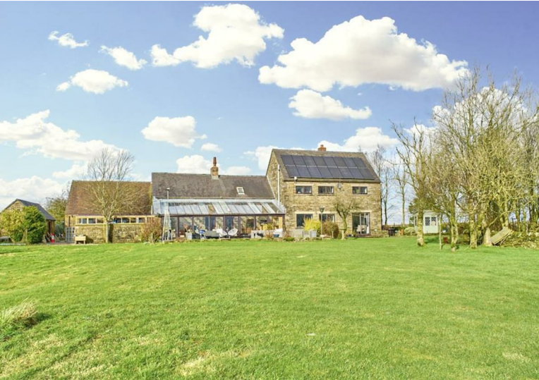
Parsons Lane, Grindon, Leek, ST13 7RH