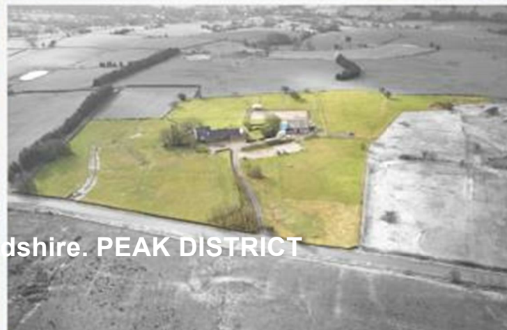
Oak Moor Farm, Grindon, Leek, Staffordshire. PEAK DISTRICT £1,435,000