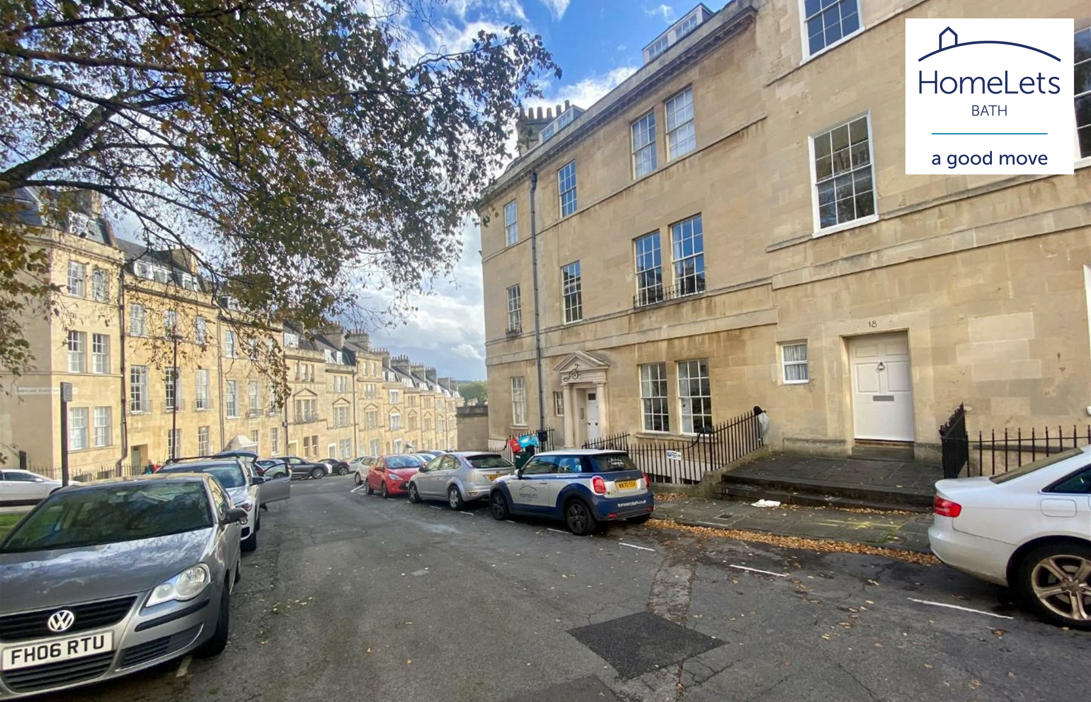
17 Portland Place, Bath, BA1 2RZ £1,650 PCM