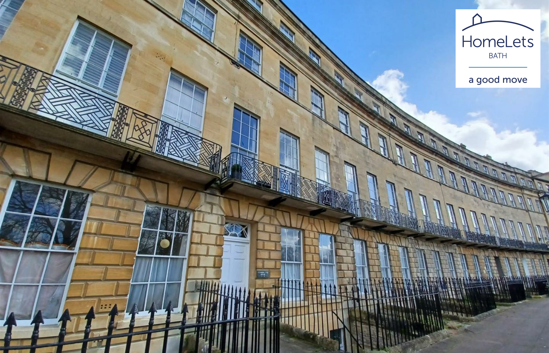
Cumberland House Norfolk Crescent, Bath, BA1 2BG £1,600 PCM