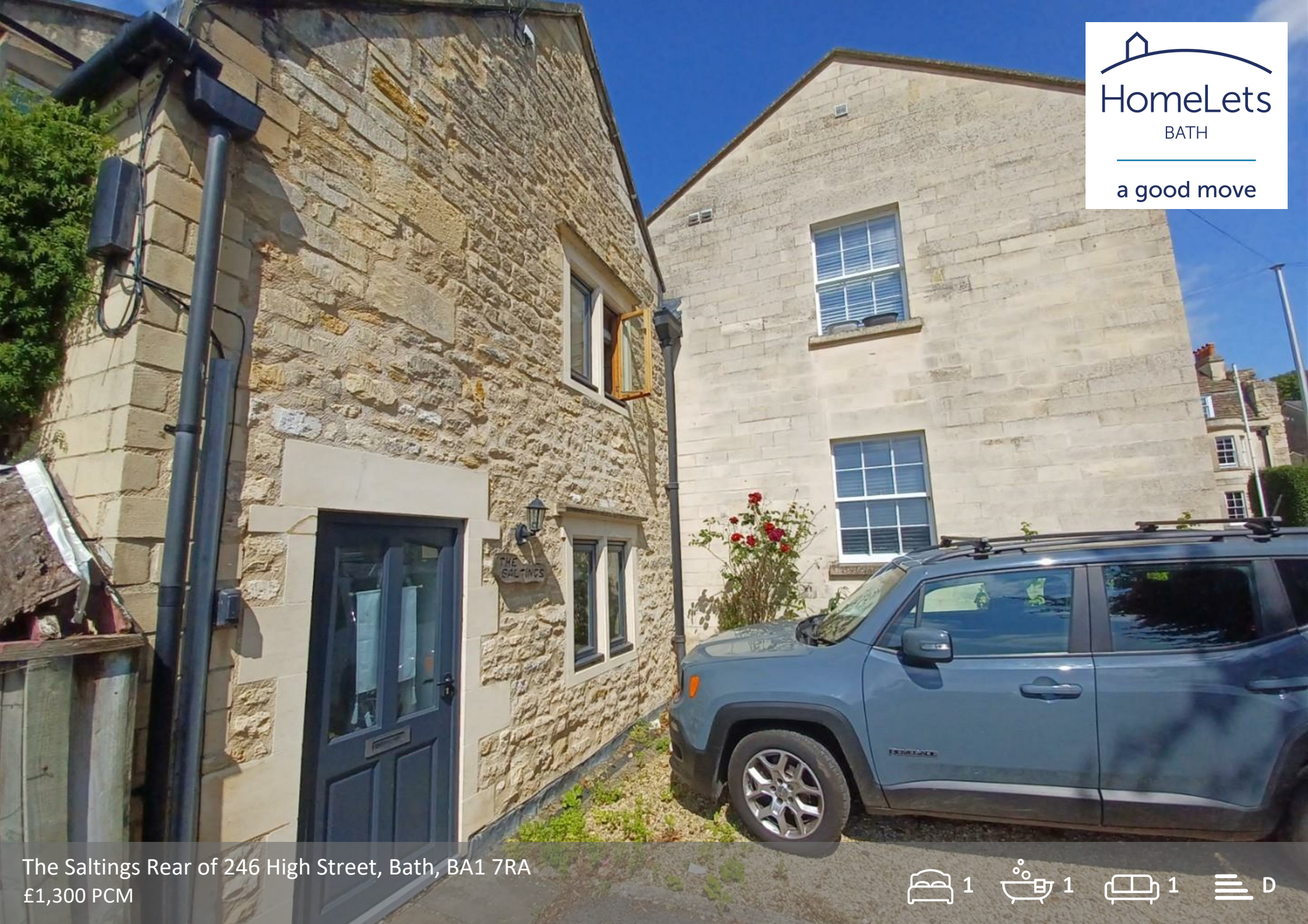
The Saltings Rear of 246 High Street, Bath, BA1 7RA £1,300 PCM