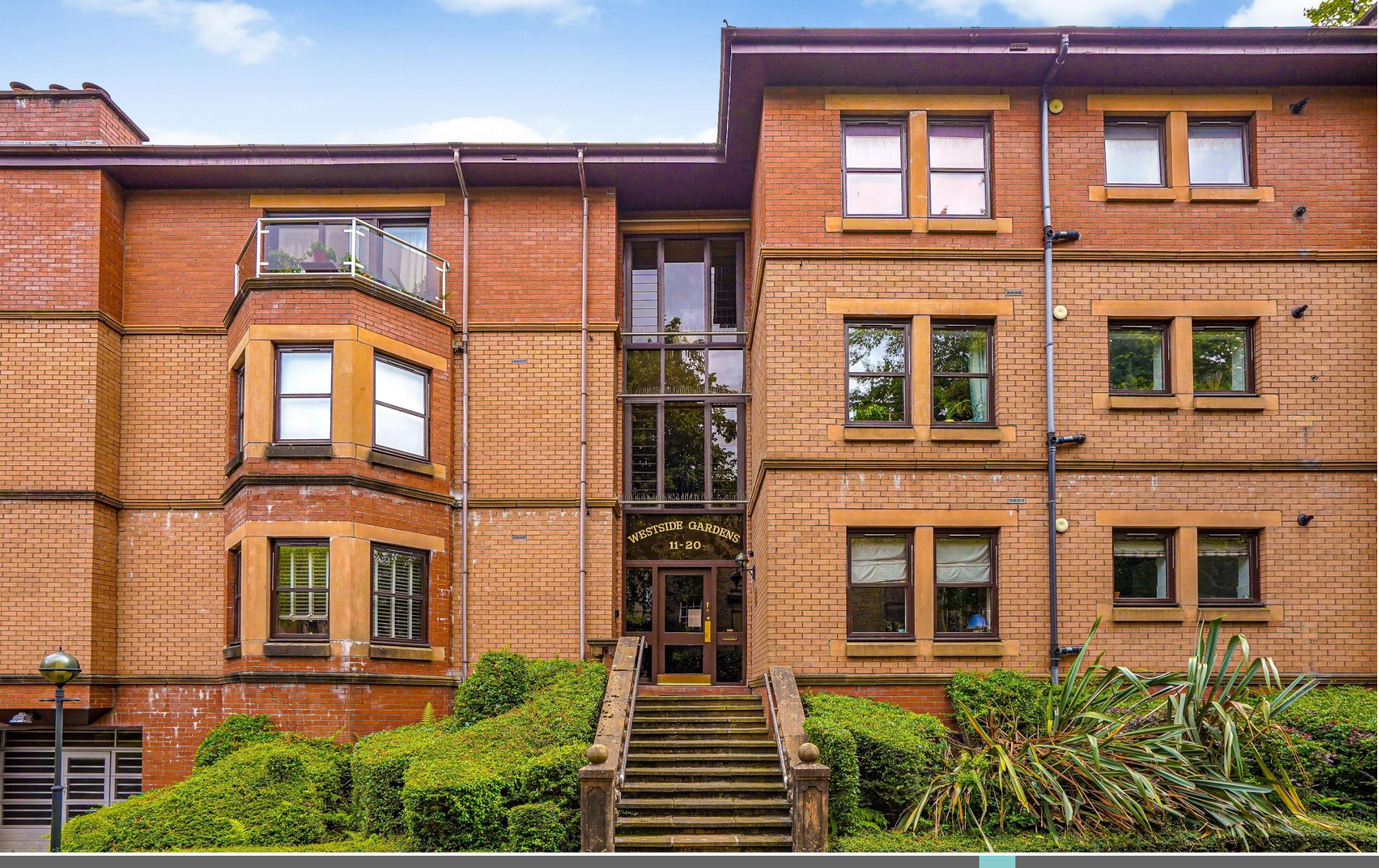
Flat 14, 4 Partickhill Road, Westside Gardens Glasgow West End | G11 5BL