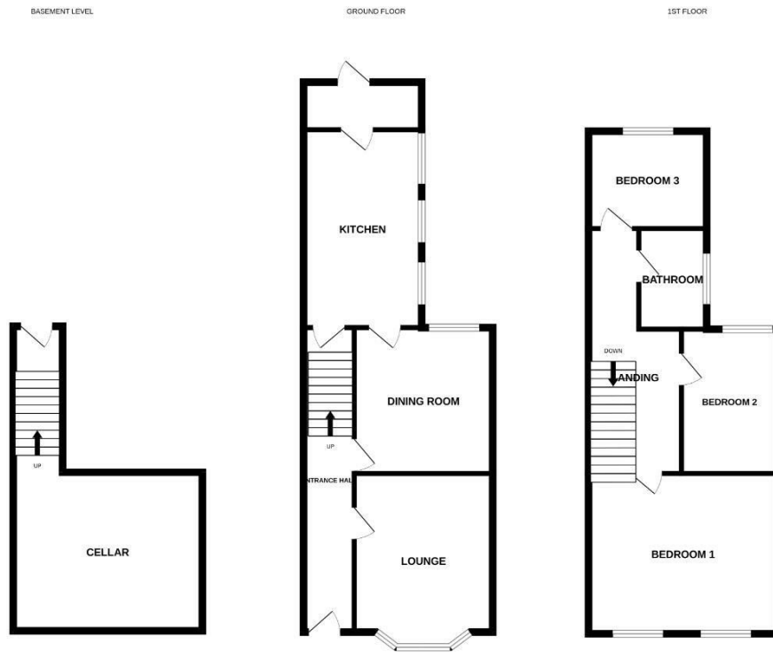
TURNER STREET, ABINGTON, NORTHAMPTON

Whilst every attempt has been made to ensure the accuracy of the floorplan contained here, measurements of doors, windows, rooms and any other items are approximate and no responsibility is taken for any error, omission or mis-statement. This plan is for illustrative purposes only and should be used as such by any prospective purchaser. The services, systems and appliances shown have not been tested and no guarantee as to their operability or efficiency can be given. Made with Metropix ©2022.