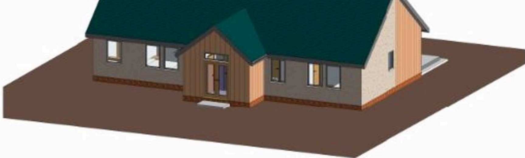
6 3D Front