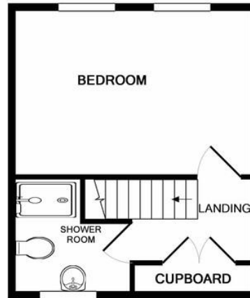
2ND FLOOR APPROX. FLOOR AREA 282 SQ.FT. (26.2 SQ.M.)

TOTAL APPROX. FLOOR AREA 1400 SQ.FT. (130.1 SQ.M.)