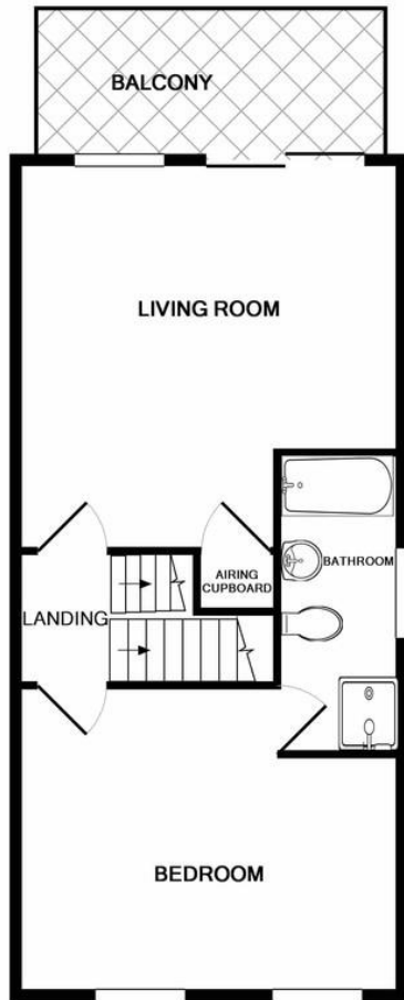
1ST FLOOR APPROX. FLOOR AREA 517 SQ.FT. (48.0 SQ.M.)