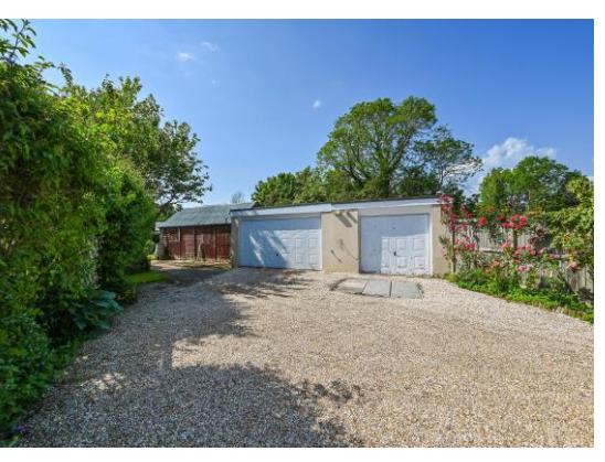
Directions SAT NAV: PO18 9TF

9a High Street, Emsworth, Hampshire PO10 7AQ Tel: 01243 377655 property@borlandandborland.co.uk www.borlandandborland.co.uk