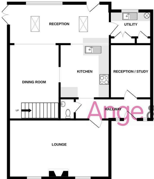
GROUND FLOOR 822 sq.ft. (76.4 sq.m.) approx.