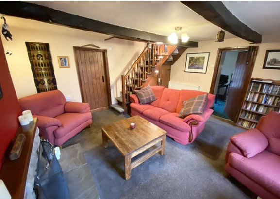
Ground Floor First Floor Externally