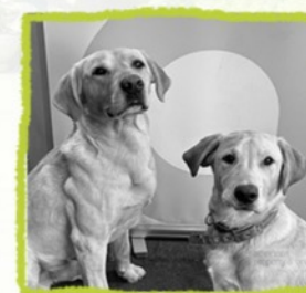
Woody & Bruce Meet & Greet Team