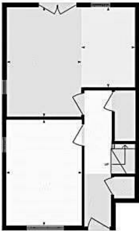
Main Floor Interior Area 460.87 sq ft

Main Building: Total Interior Area 930.39 sq ft