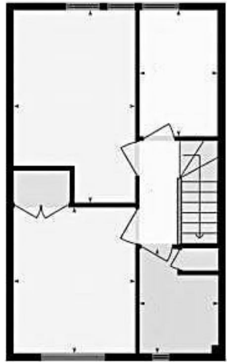
1st Floor Interior Area 469.51 sq ft