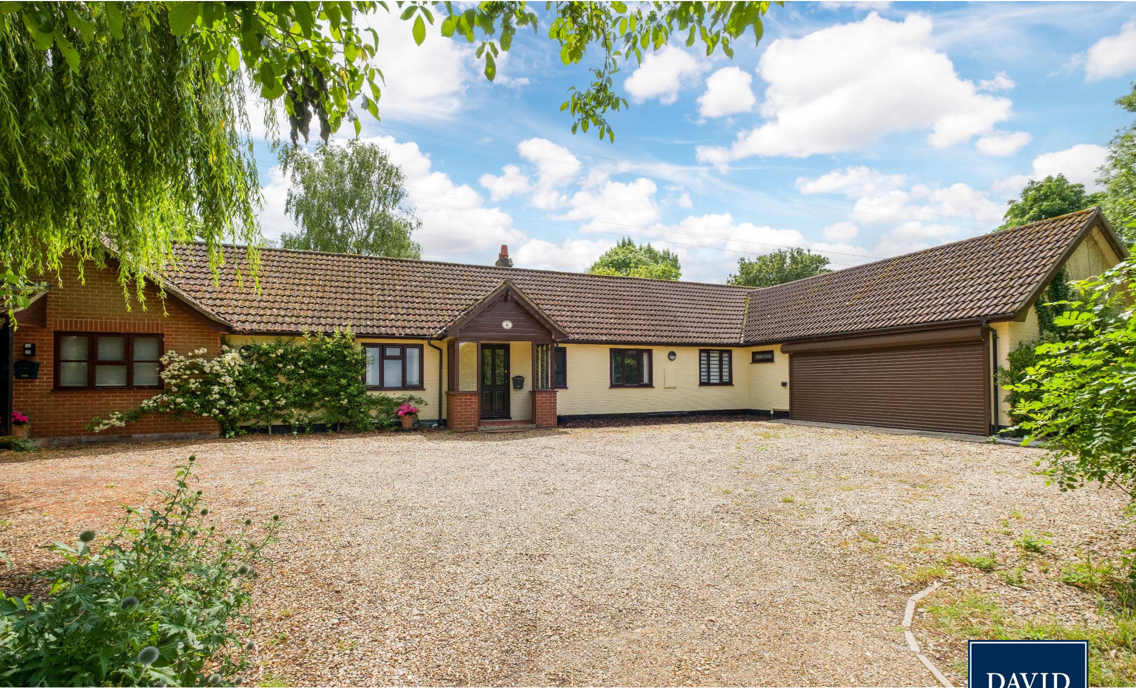
Willow Lodge, Mellis, Suffolk