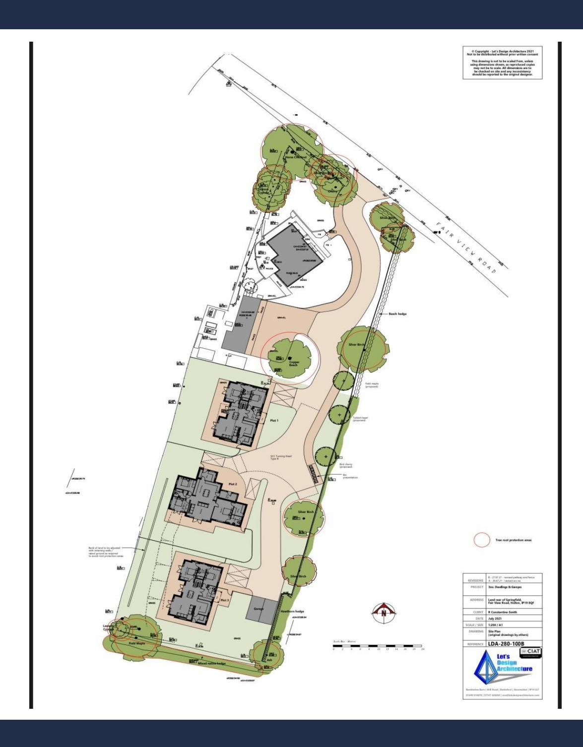
Land At Springfield, Fairview Road, Halesworth, Suffolk, IP19 8QF.

Full planning permission was granted in 2023 for a development scheme comprising three detached units: