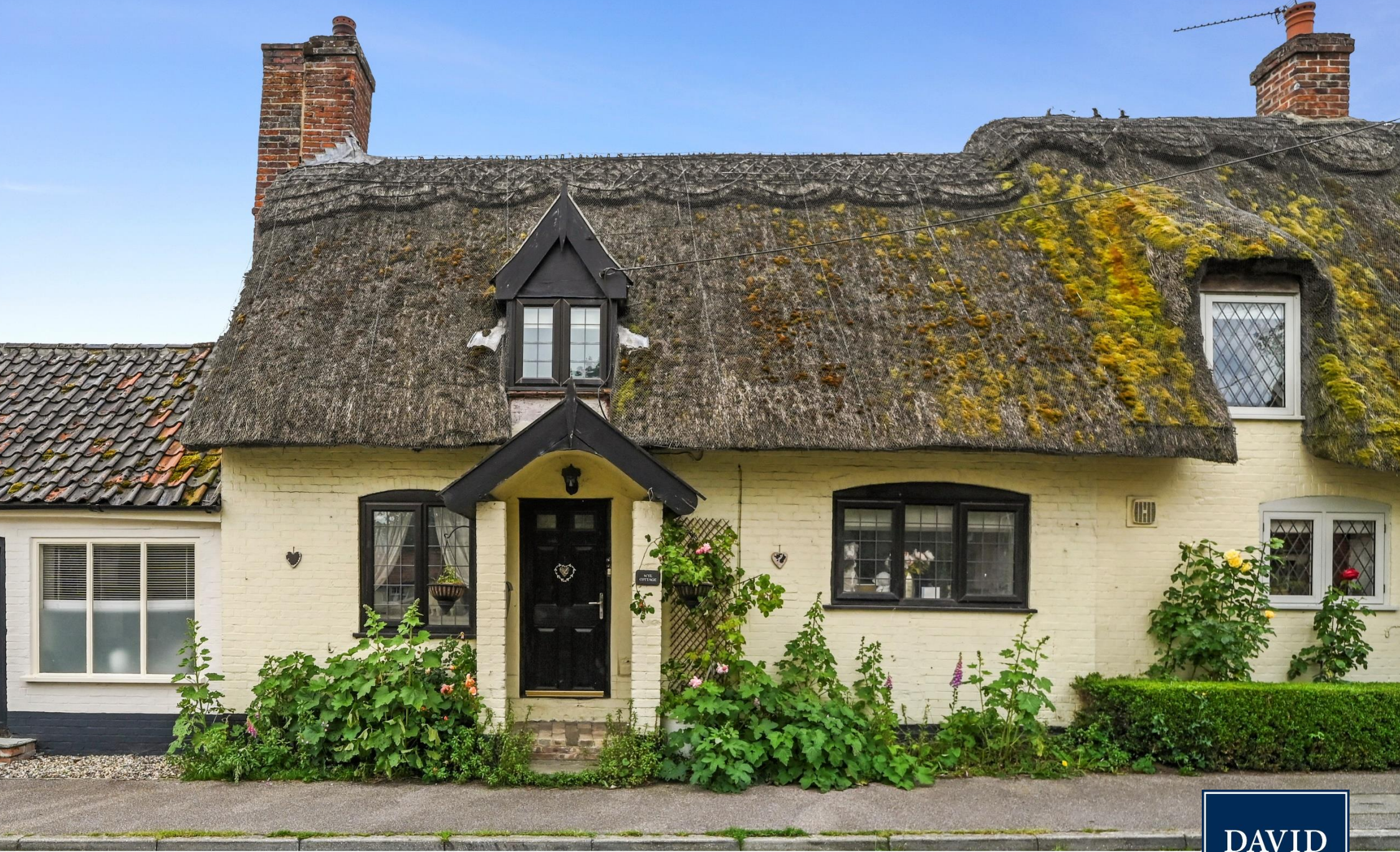
Wye Cottage Badwell Ash, Suffolk