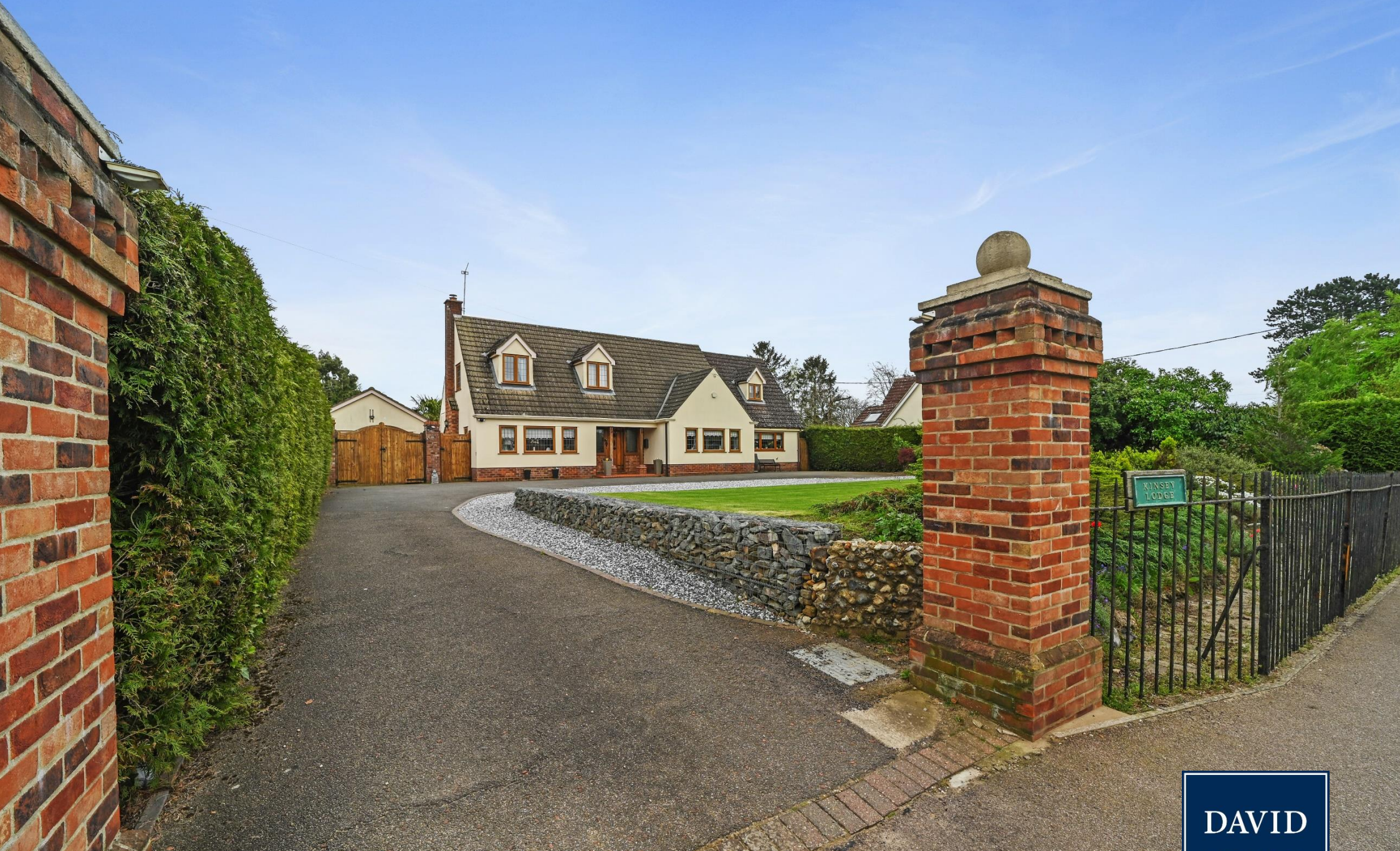
Kinsey Lodge Elmswell, Suffolk