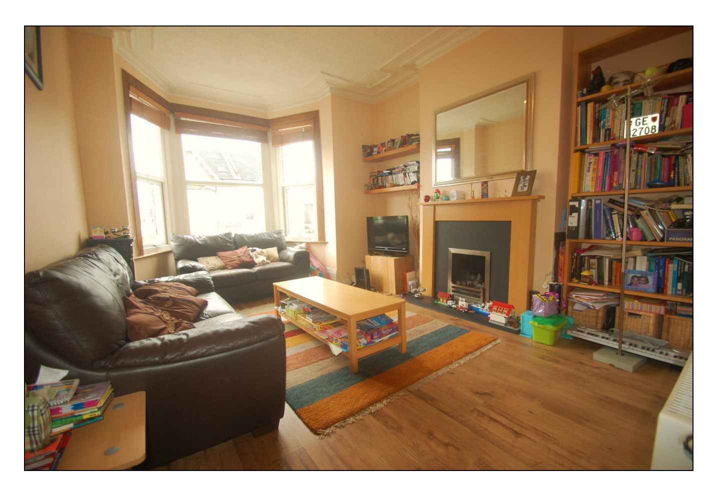
Flat 2, Springfield Road, Wimbledon £1,475 pcm