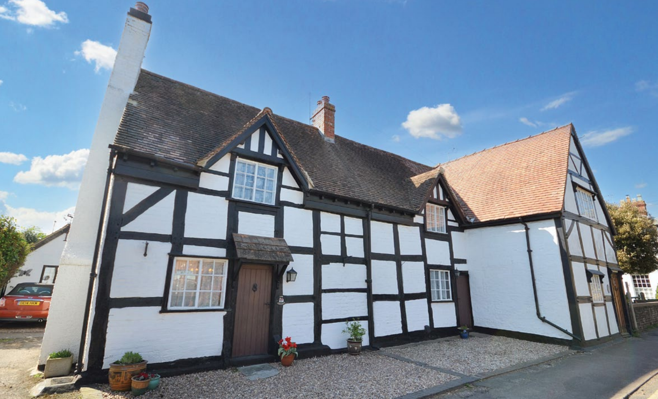
THE COTTAGE AND ANNEX Church Street | Eckington | WR10 3AN