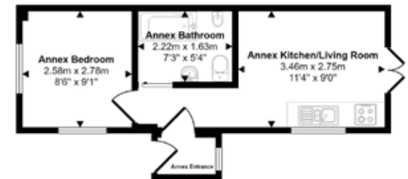
Annexe Approx 25 sq m / 271 sq ft

This floorplan is only for illustrative purposes and is not to scale. Measurements of rooms, doors, windows, and any items are approximate and no responsibility is taken for any error, omission or mis-statement. Icons of items such as bathroom suites are representations only and may not look like the real items. Made with Made Snappy 360.