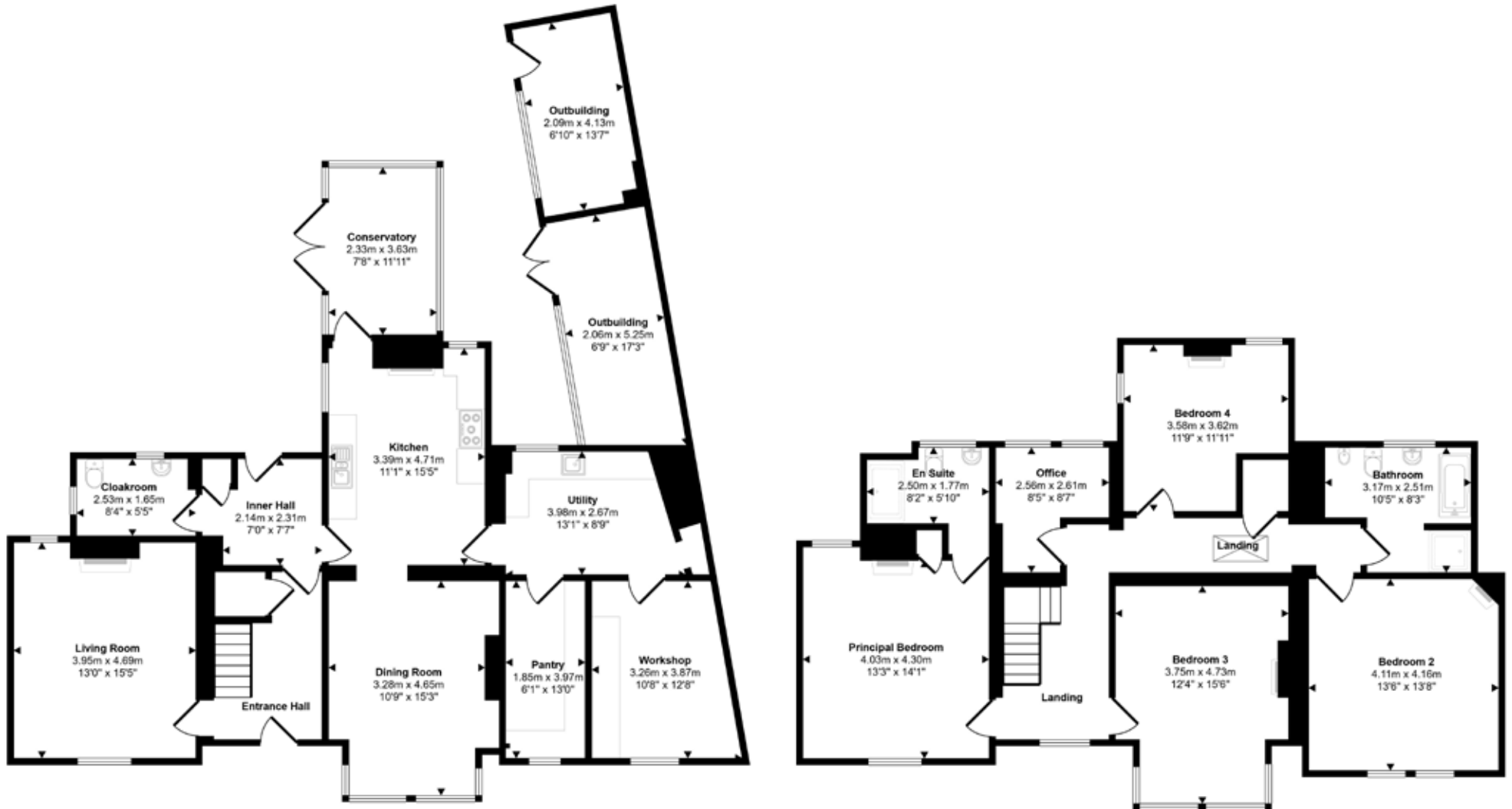
Ground Floor Approx 135 sq m / 1458 sq ft

Approx Gross Internal Area 242 sq m / 2606 sq ft