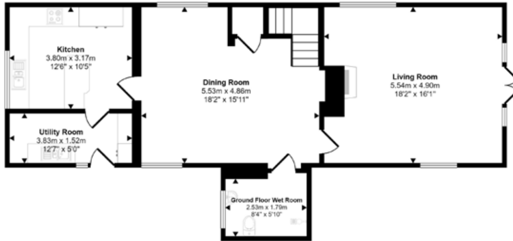
Ground Floor Approx 80 sq m / 866 sq ft

Approx Gross Internal Area 193 sq m / 2079 sq ft