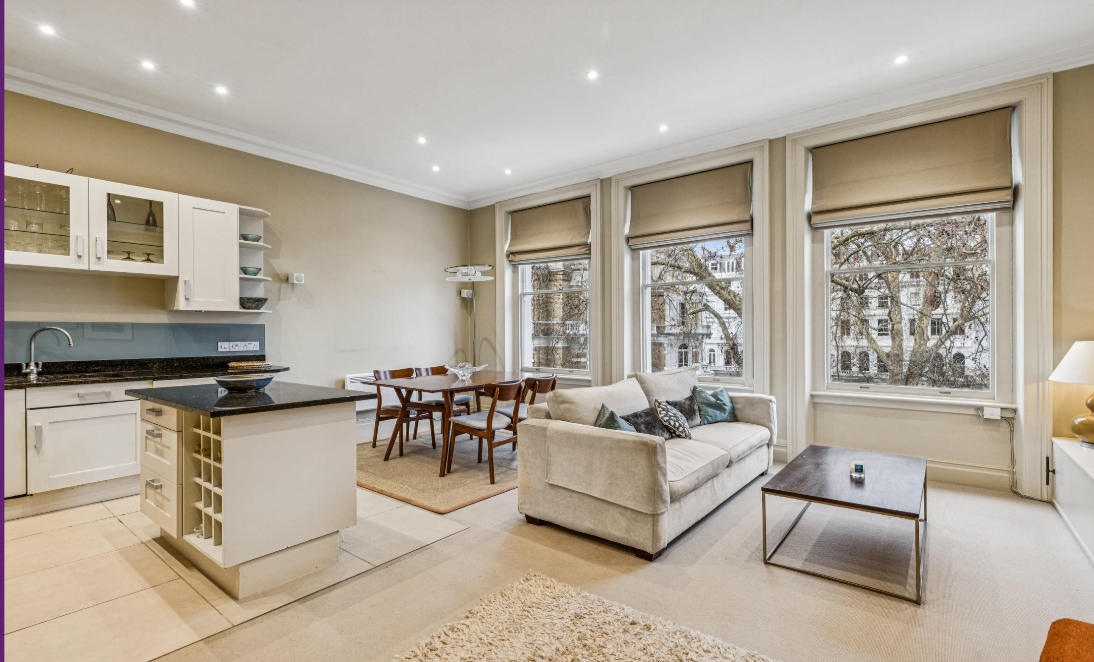
Cornwall Gardens South Kensington, SW7