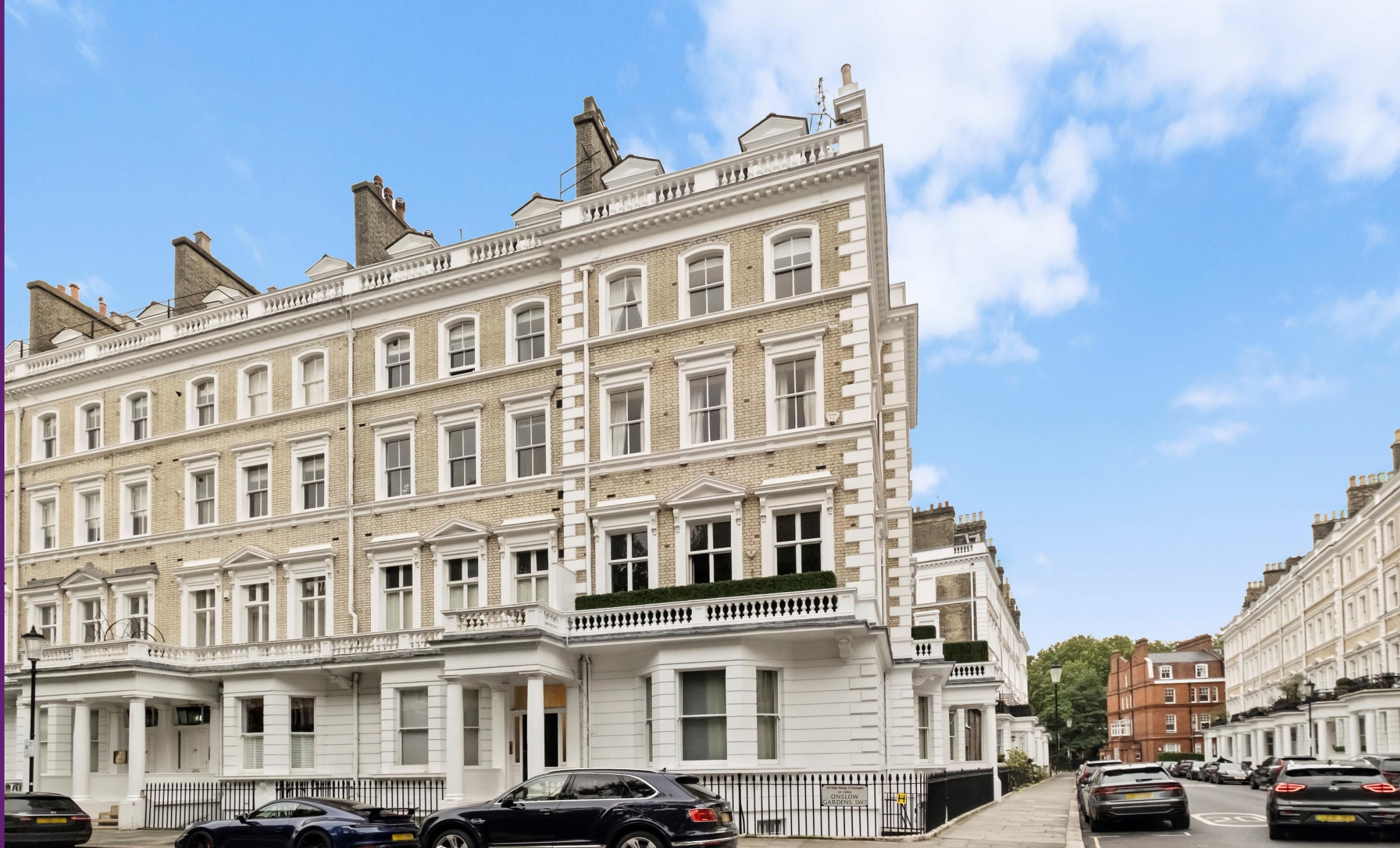
Onslow Gardens South Kensington, SW7