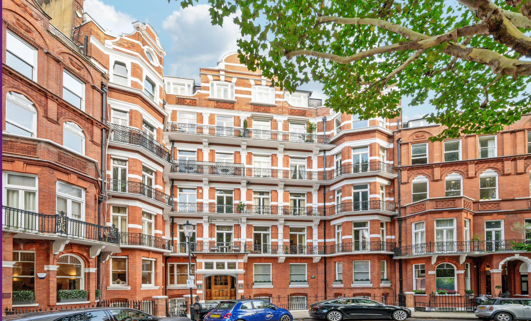
Barkston Gardens Earls Court, SW5