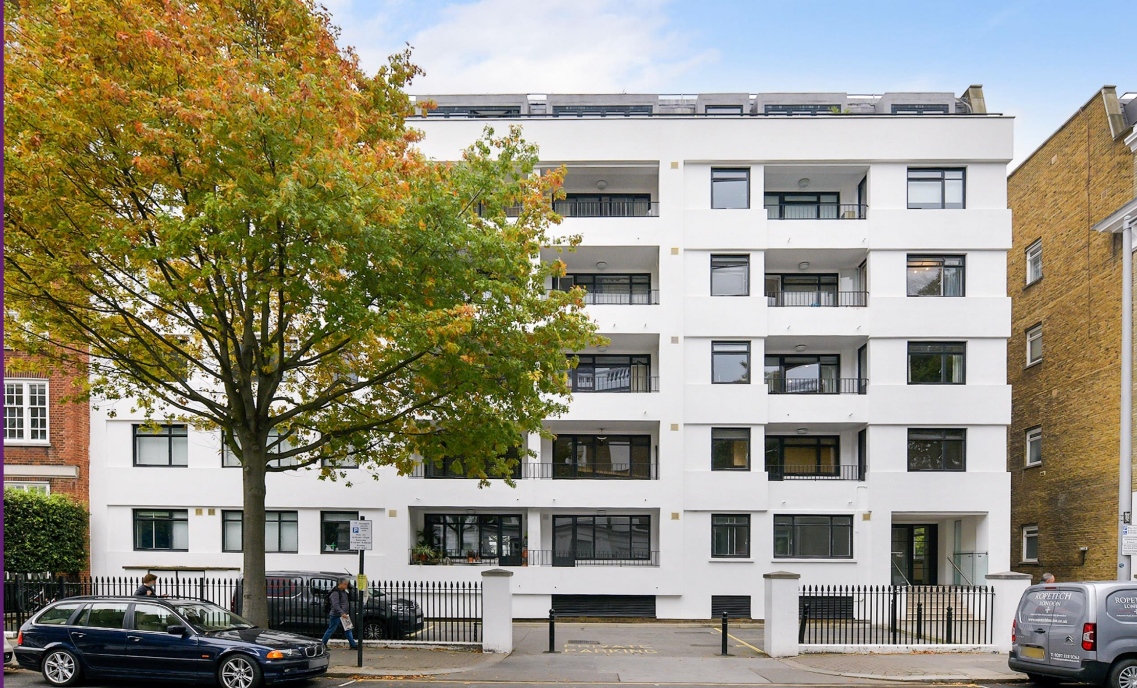
Onslow Square South Kensington, SW7