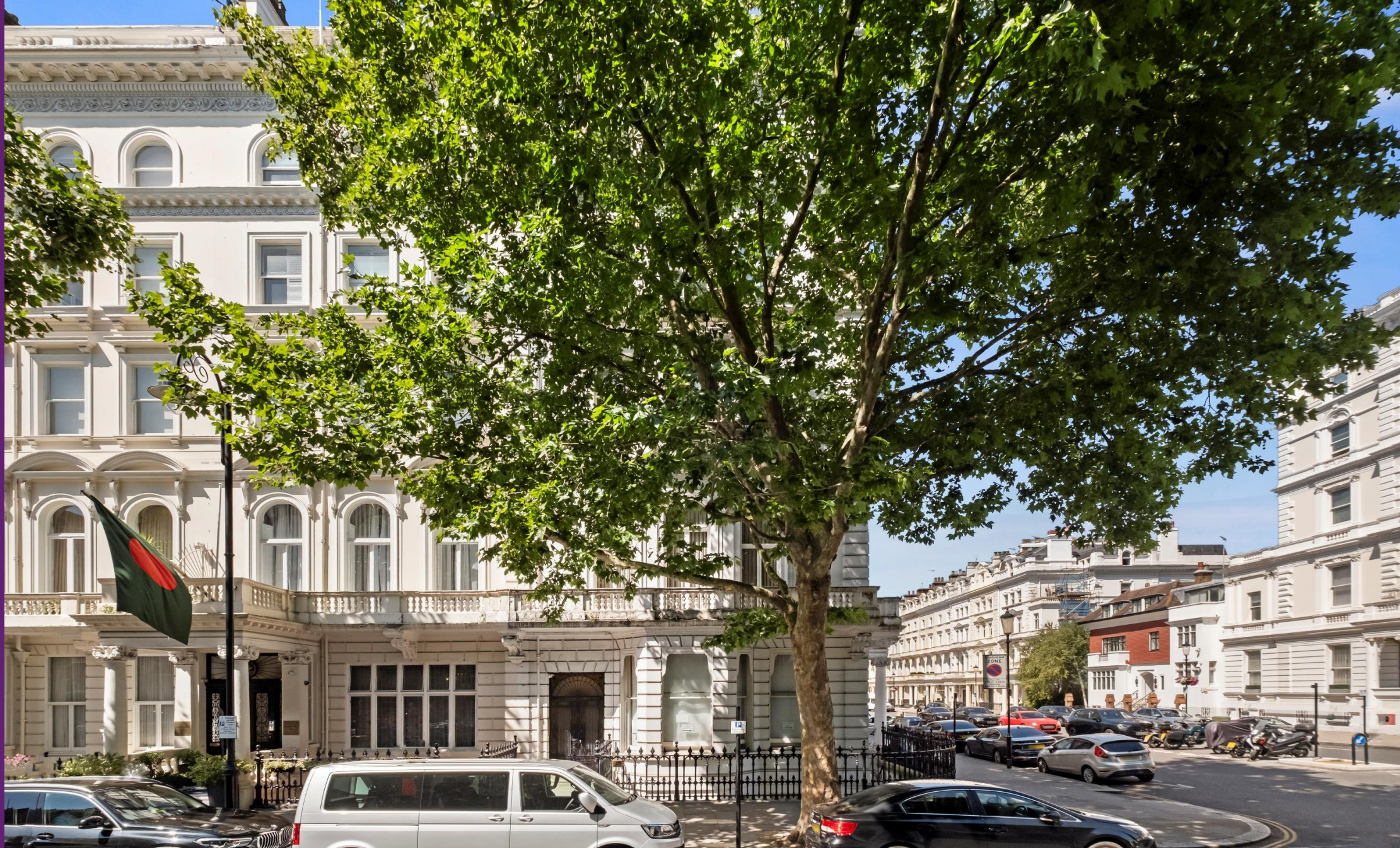
Queens Gate South Kensington, SW7