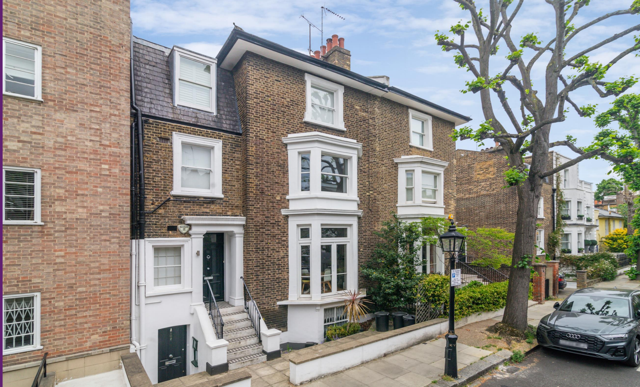
Clareville Grove South Kensington, SW7