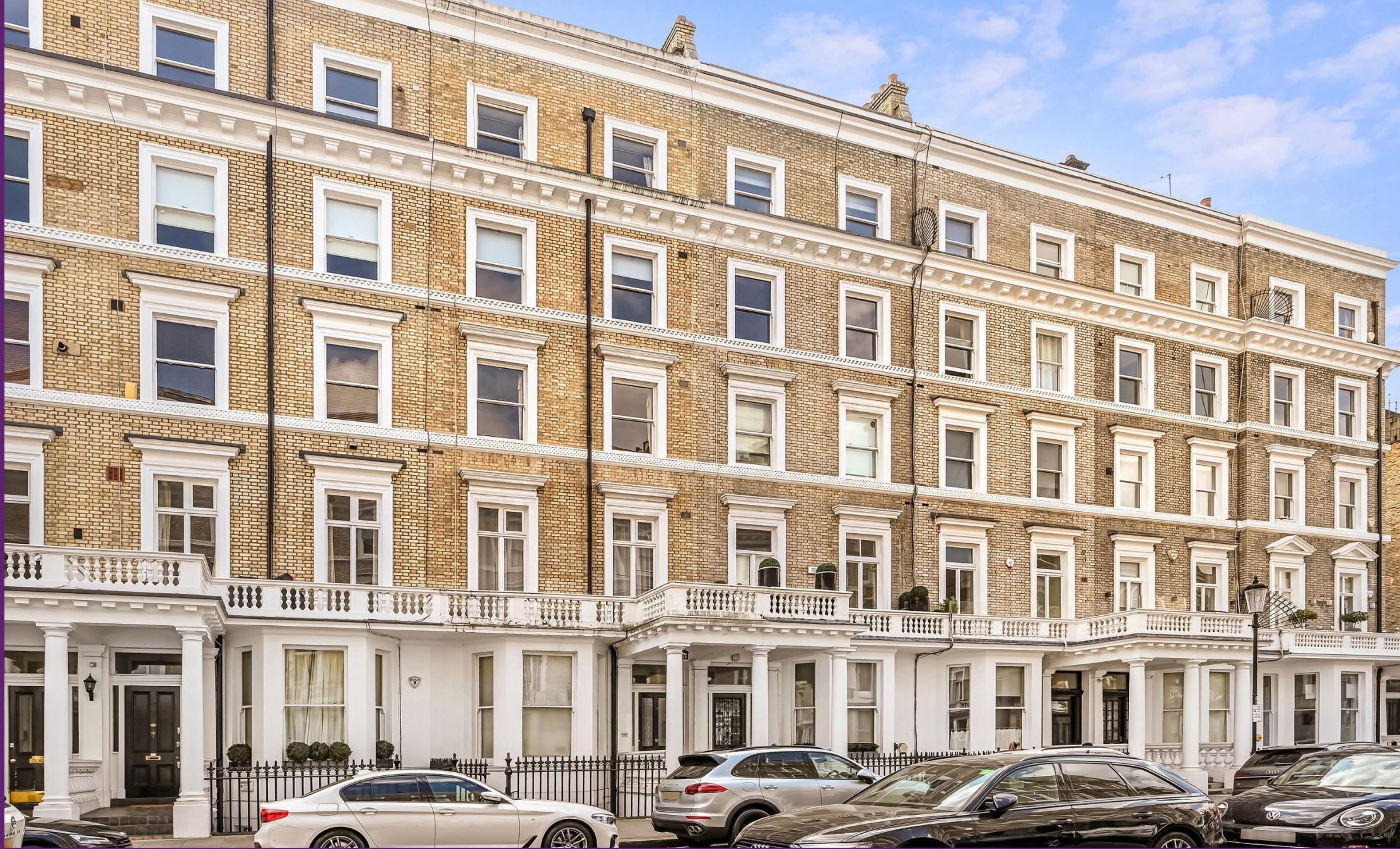
Elvaston Place South Kensington, SW7