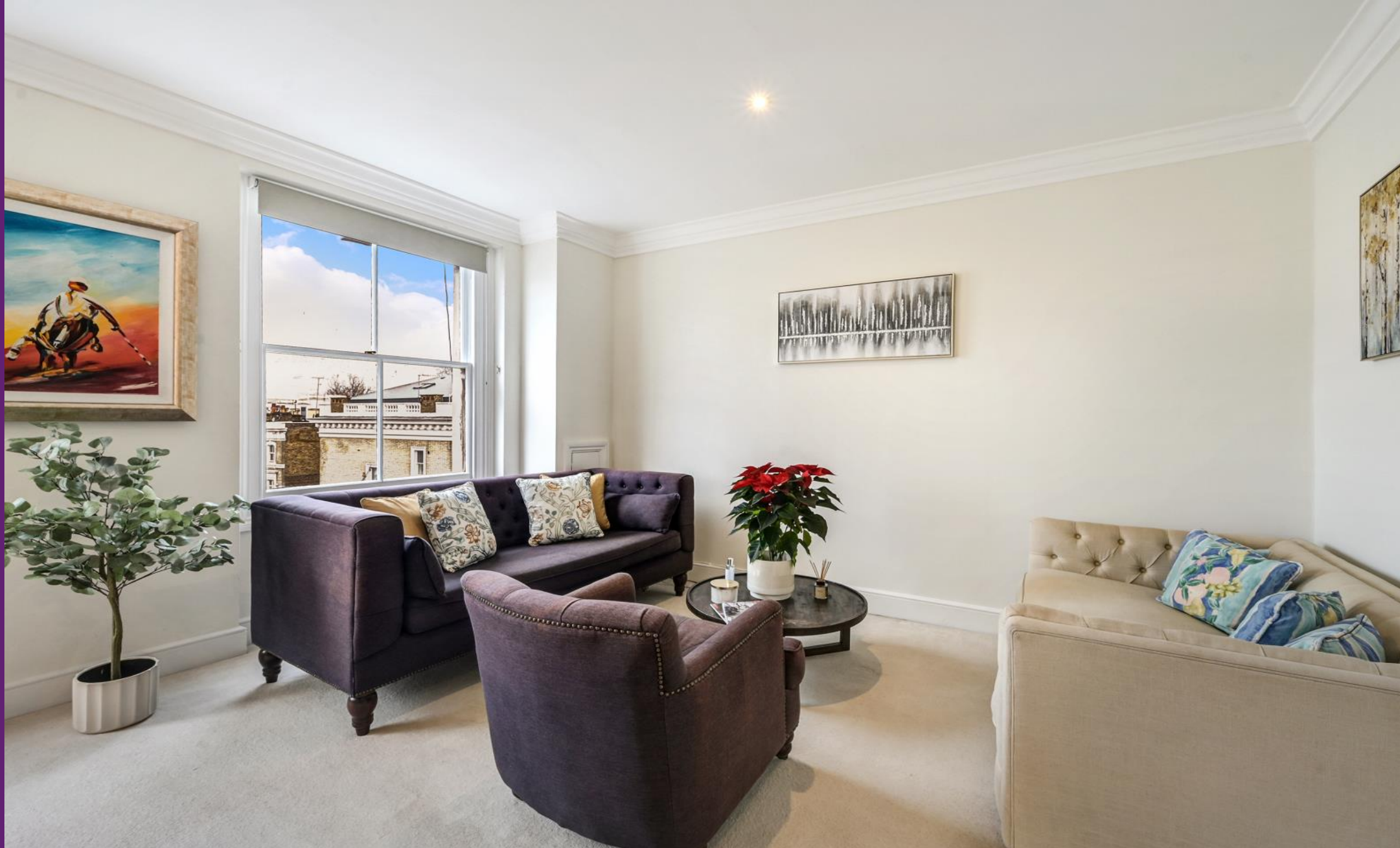
Redcliffe Gardens Chelsea, SW10