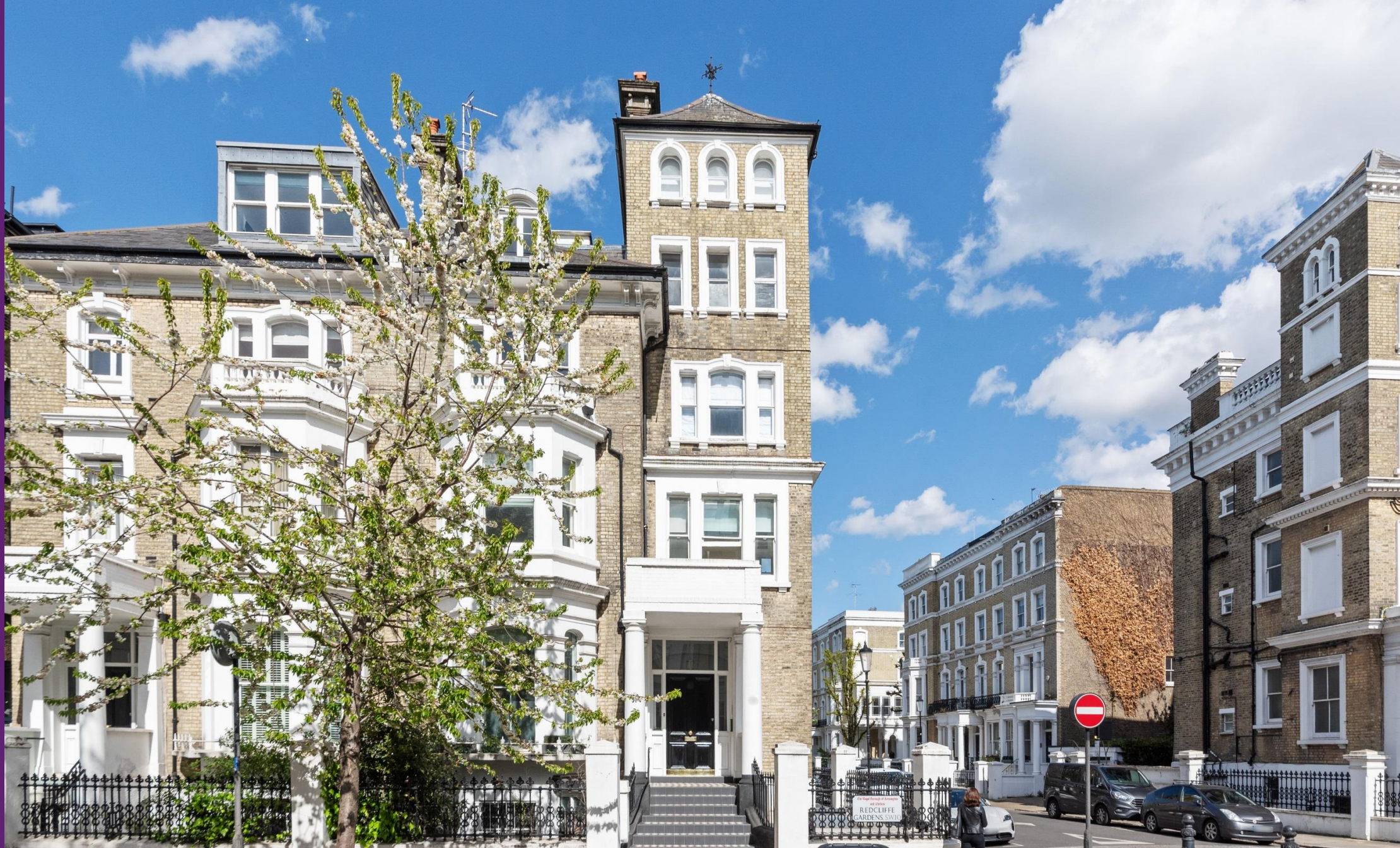
Redcliffe Gardens Chelsea, SW10