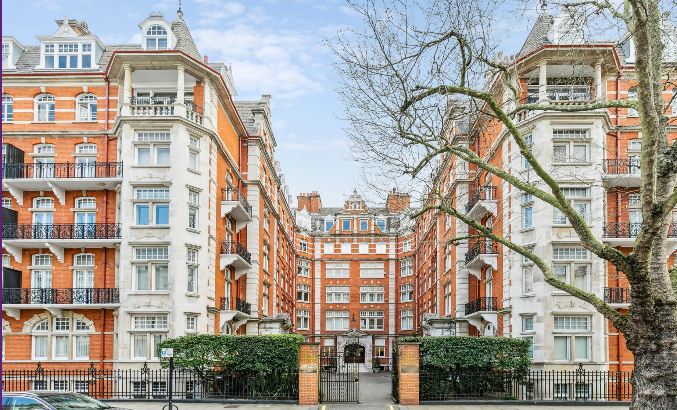
Alexandra Court Queen's Gate, South Kensington, SW7