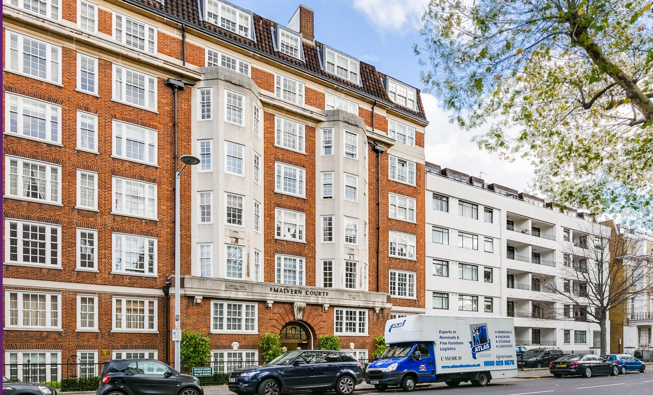
Malvern Court Onslow Square, SW7