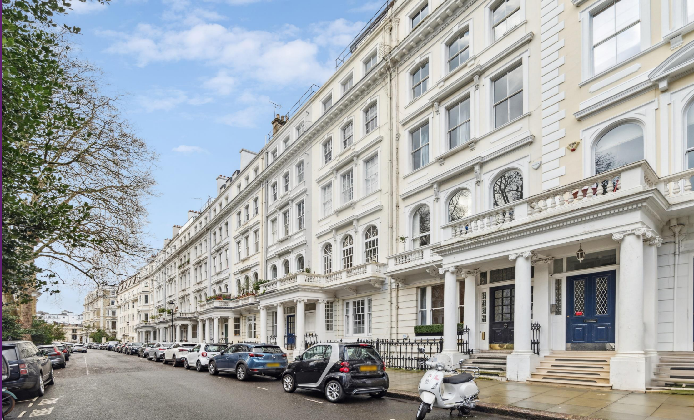
Cornwall Gardens South Kensington, SW7