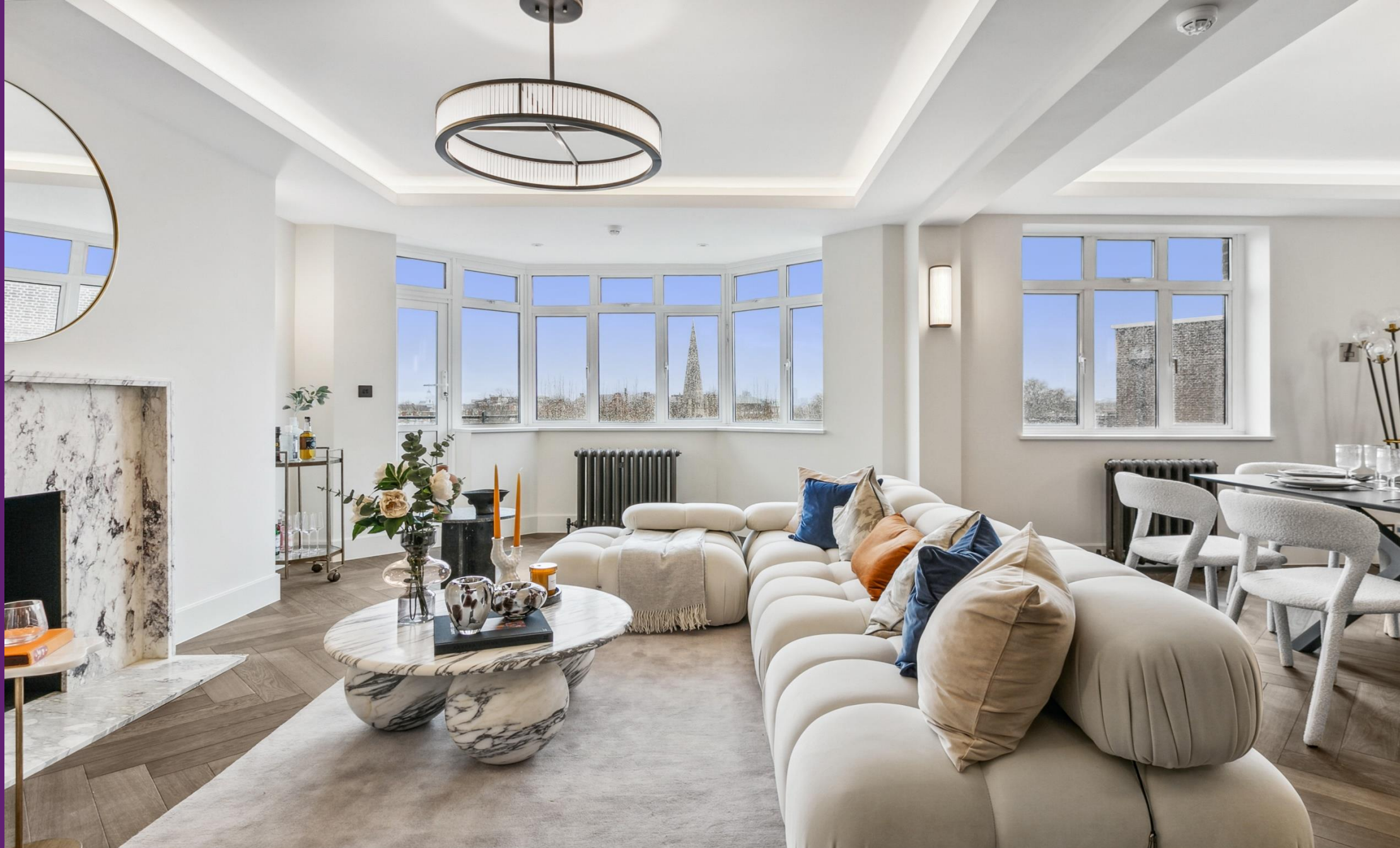
Melton Court Onslow Crescent, SW7