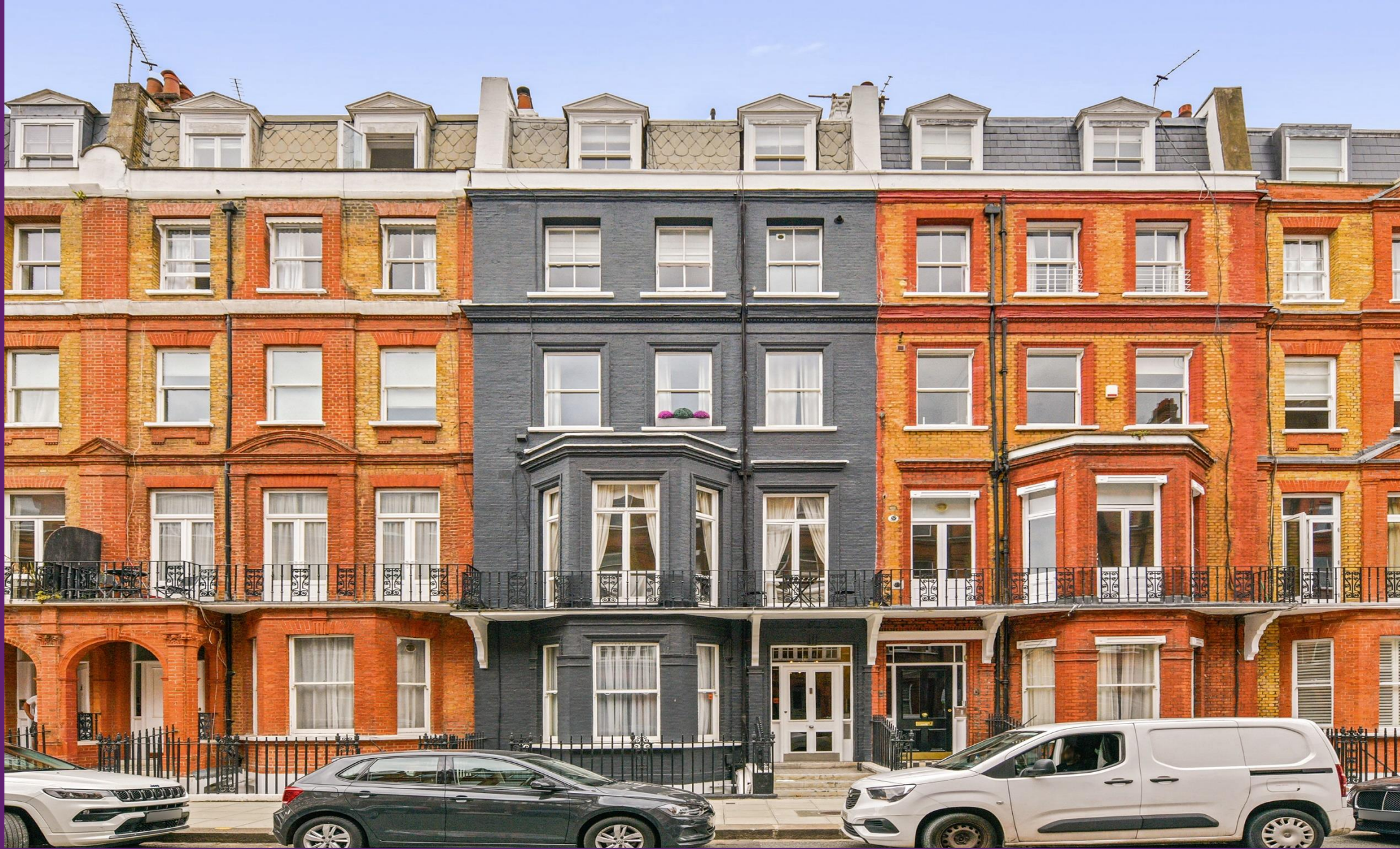
Brechin Place South Kensington, SW7