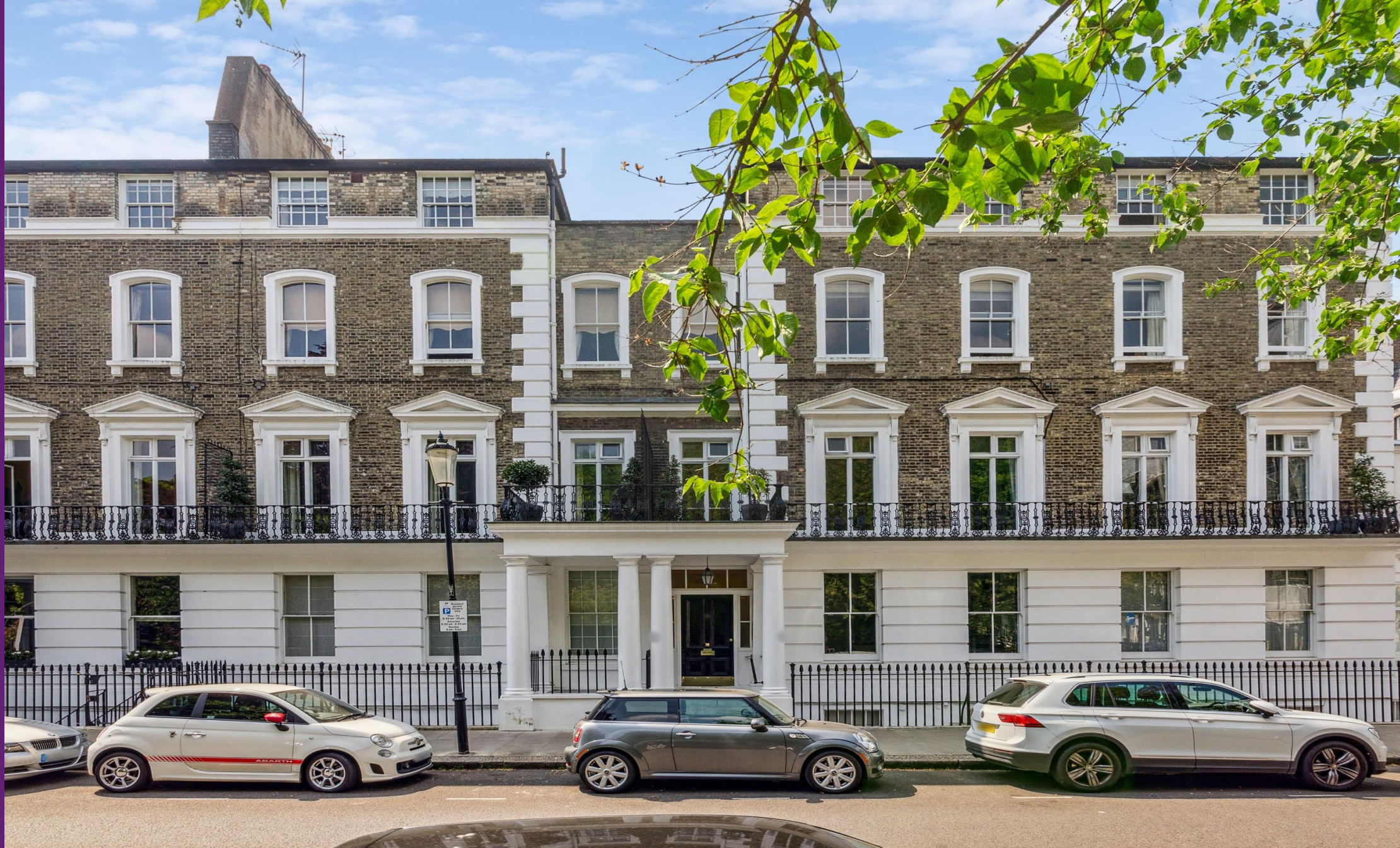
Onslow Square South Kensington, SW7