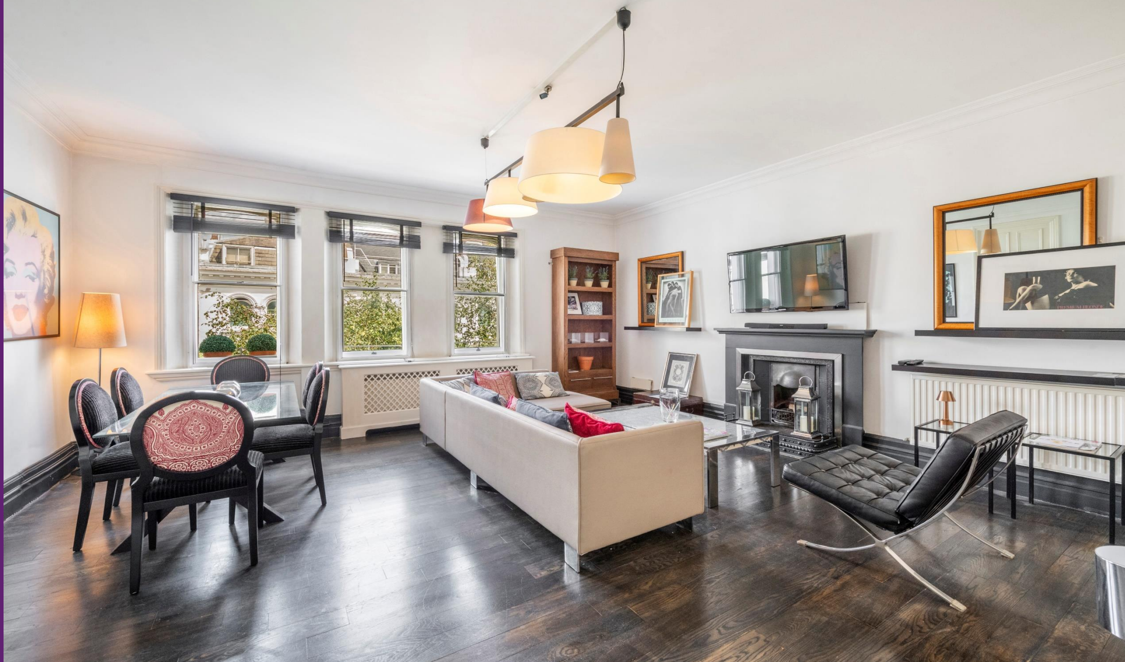
Sumner Place South Kensington, SW7