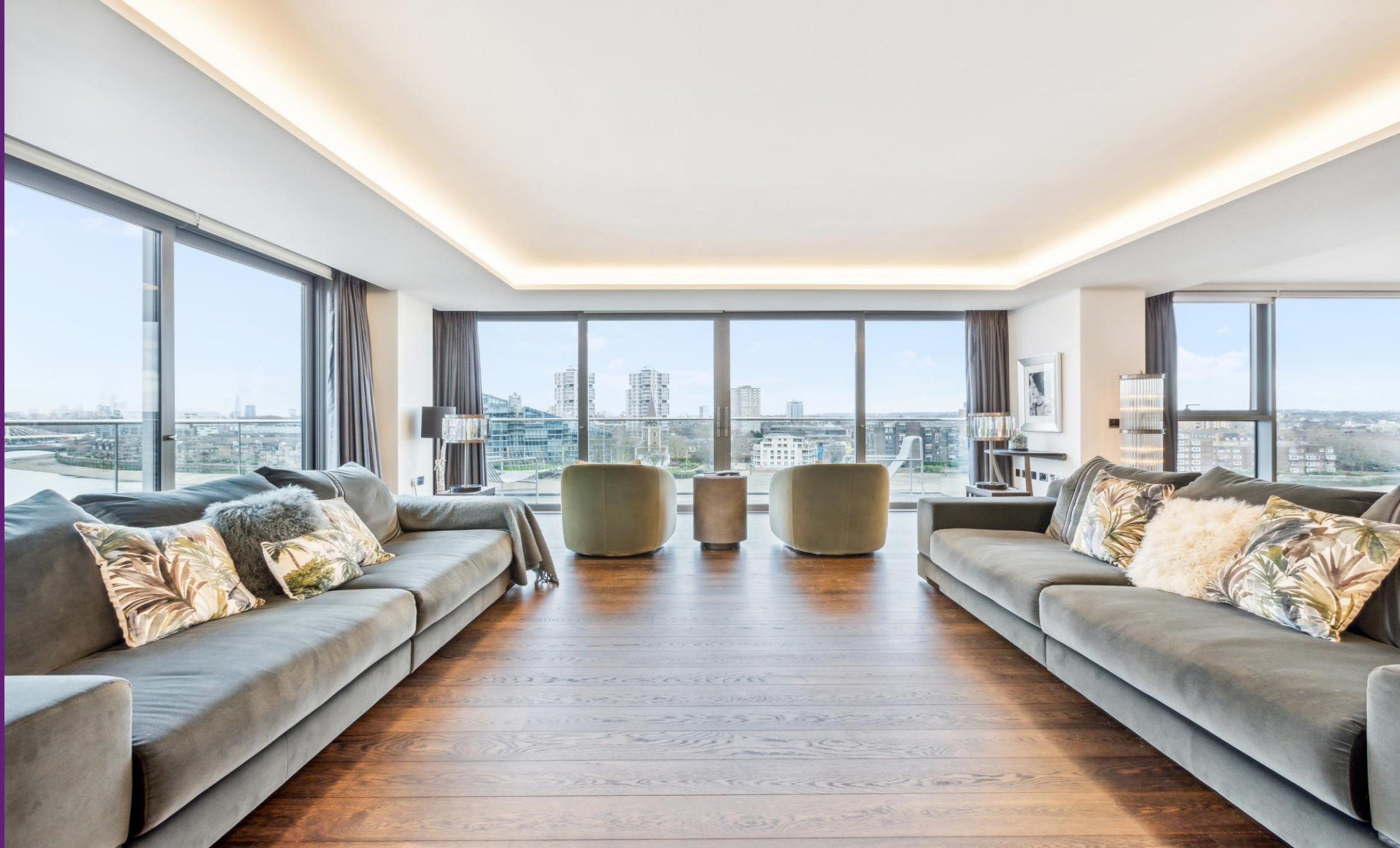
Claydon House Chelsea Waterfront, SW10